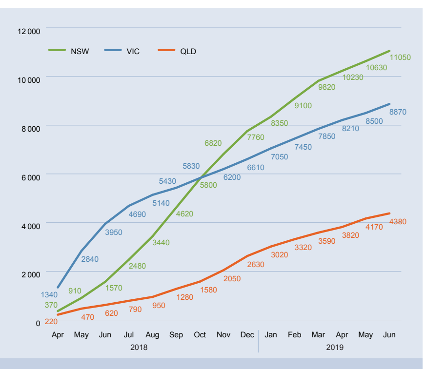
Figure 2: Cumulative (total) number of people in Victoria, NSW and Queensland with one or more dispensed PBS-subsidised PrEP prescriptions from April 1st 2018

An unknown number were selfimporting. It is likely that by June 2019, all patients have transitioned from demonstration studies. The cumulative number of people in each state who have been dispensed one or more PBS subsidised PrEP prescriptions changed rapidly in the first months after PBS listing (Figure 1 and Figure 2). This is likely to represent rates of transition from state-based demonstration studies.