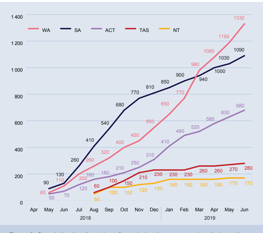
Figure 3: Cumulative (total) number of people in other states and territories with one or more dispensed PBS-subsidised PrEP prescriptions from April 1<sup>st</sup> 2018<sup>4</sup>.

Figure 2: Cumulative (total) number of people in Victoria, NSW and Queensland with one or more dispensed PBS-subsidised PrEP prescriptions from April 1st 2018