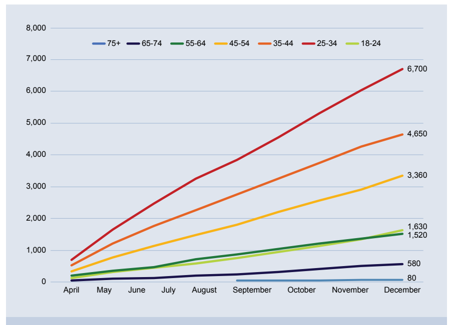
Figure 4: Cumulative (total) number of people in each age bracket with one or more dispensed PBS-subsidised PrEP prescriptions from April 1st 2018<sup>7</sup>

Of the 18,530 individuals dispensed PBS-subsidised PrEP prescriptions, 18,360 (99.1%) were recorded as male and 170 (0.9%) as female<sup>6</sup>. 11,350 (61.3%) were aged between 25 and 44 years, while 2,180 (11.8%) were aged over 54 years.