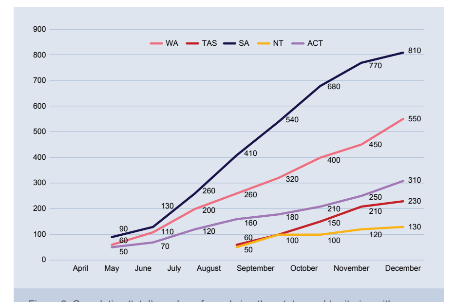
Figure 3: Cumulative (total) number of people in other states and territories with one or more dispensed PBS-subsidised PrEP prescriptions from April 1st 2018 ^5 .