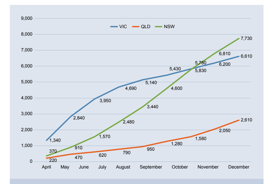
Figure 2: Cumulative (total) number of people in Victoria, NSW and Queensland with one or more dispensed PBS-subsidised PrEP prescriptions from April 1st 2018

The number of individuals in each state with dispensed PBS-subsidised PrEP reflects the rate of transition from each demonstration study to PBS subsidised medication<sup>4</sup>. Transition to PBS from demonstration studies occurred sooner in Victoria than in NSW.