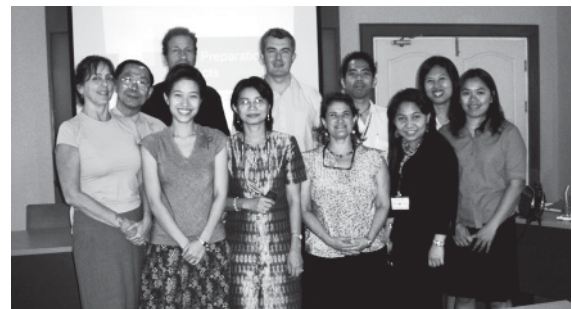
Researchers from the Thai Red Cross AIDS Research Centre, the University of California, San Francisco, St Vincent's Hospital, Sydney and NCHECR working on HIV prevention studies in Thailand

In the area of viral hepatitis prevention, work continued on the ongoing evaluation of the Sydney Medically Supervised Injecting Centre (MSIC), and a new study of injecting-related injury and disease that was initiated through the evaluation of the MSIC. The three-country project on the role of resilience in protecting against blood-borne viruses and sexually transmissible infections in Indigenous people completed a round of stakeholder consultations at three Australian sites.