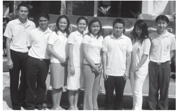
HIV-NAT data team

Funding: HIV-NAT; Merck Sharp & Dohme; Ministry of Public Health