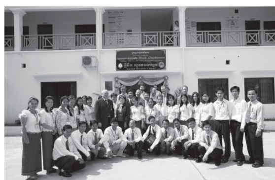
Staff and friends at the opening of the new premises of the Social Health Clinic in Phnom Penh, Cambodia